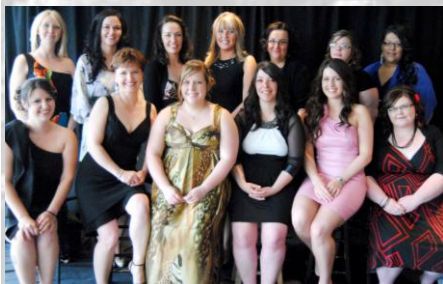
SUNTEP PA Class of 2012.