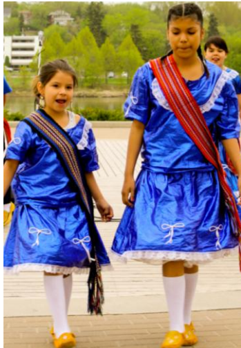
St. Mary's School Jiggers perform at the GDI-MVA announcement.

GDI and Meewasin Valley Authority have partnered to nominate the Saskatchewan and South Saskatchewan rivers for national heritage status. The rivers have been nominated for Canadian Heritage River designation, a national recognition given to rivers with extraordinary natural, cultural, and recreational significance. It promotes, preserves, and enhances Canada's river heritage, and ensures Canada's leading rivers are managed in a sustainable way.