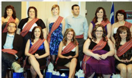
SUNTEP Saskatoon Class of 2012.

GDI and Meewasin Valley Authority have partnered to nominate the Saskatchewan and South Saskatchewan rivers for national heritage status. The rivers have been nominated for Canadian Heritage River designation, a national recognition given to rivers with extraordinary natural, cultural, and recreational significance. It promotes, preserves, and enhances Canada's river heritage, and ensures Canada's leading rivers are managed in a sustainable way.